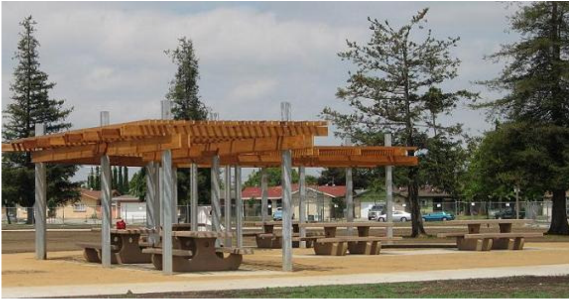
Figure 4: Welch Park Group Picnic Area