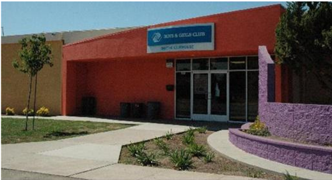
Figure 3: Boys and Girls Club