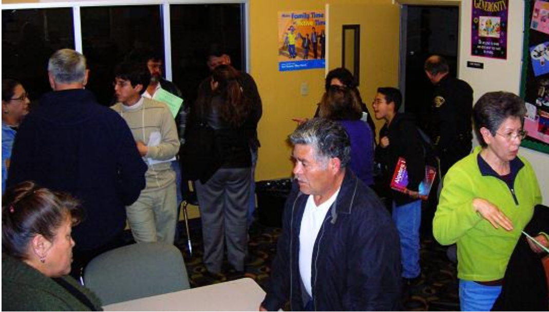
Figure 5: Tully Ocala Capitol King Neighborhood Association Meeting

Between 2002 and 2008, significant progress was made on the K.O.N.A. neighborhood's Top Ten priority project list.