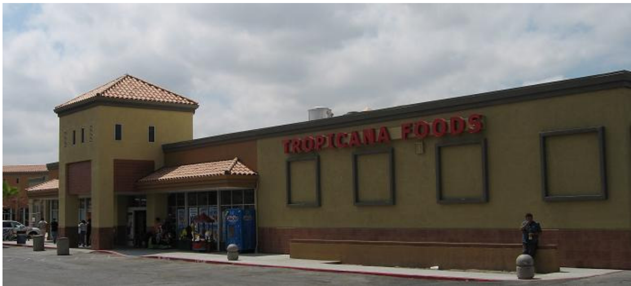
Figure 1: Tropicana Shopping Center